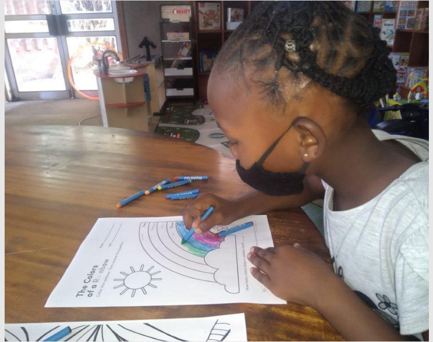
Colouring-in activity at Viljoenskroon Public Library.