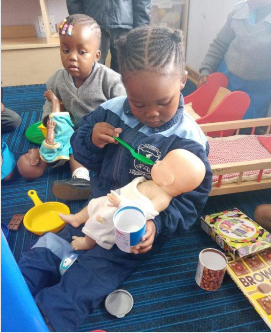
Kids playing with educational toys